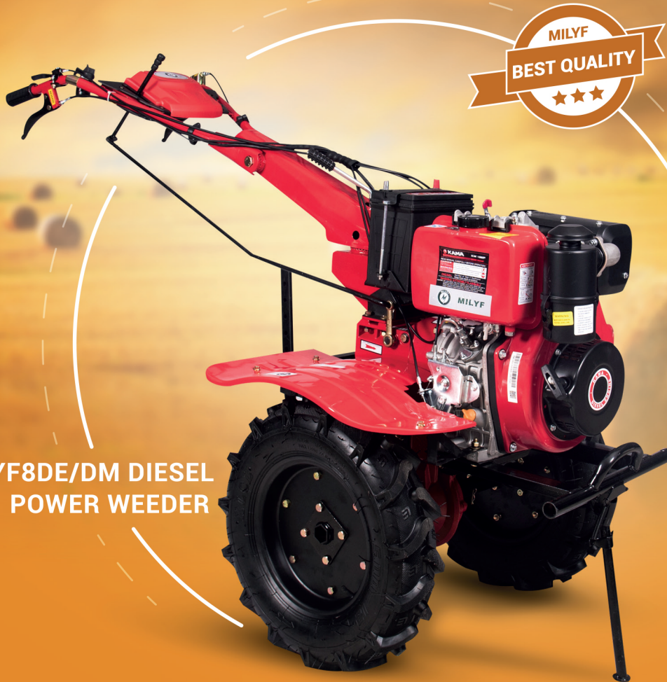
MILYF8DE/DM DIESEL POWER WEEDER