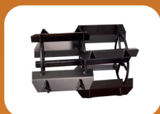
Paddy Wheel for Wetland