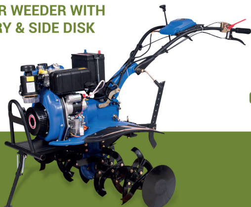
POWER WEEDER WITH ROTARY & SIDE DISK