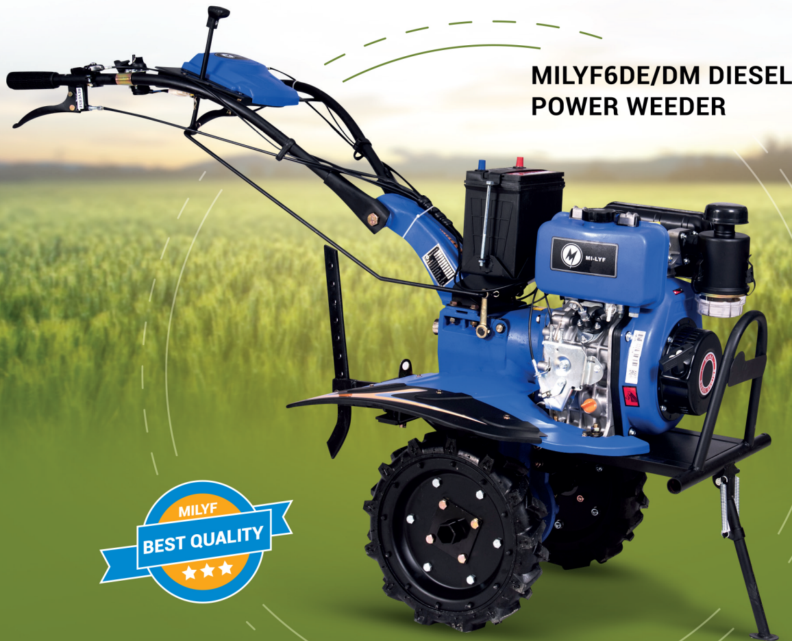
MILYF6DE/DM DIESEL POWER WEEDER